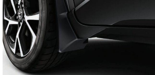
FRONT & REAR MUD GUARDS

Tailored to fit the boot of your vehicle and provide protection against dirt and spills.