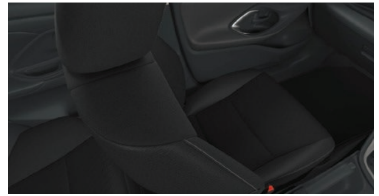
Black quilted fabric, grey stitching (FB20)

A choice of two colours are now available with a unified black instrument panel that delivers a fresh image.