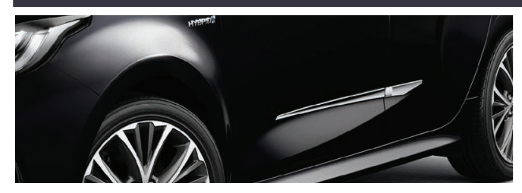
SIDE CHROME GARNISH

Contoured to integrate smoothly with the side of your car and create a powerful low profile appearance.