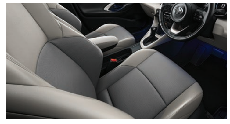
Light grey partial leather (EA10) - Platinum Only.