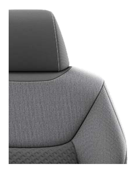
Black fabric upholstery with light black roof lining (Luna Sport) (FC20)