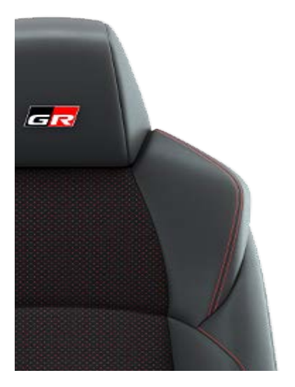
GR SPORT suede and synthetic leather upholstery with red stitching (GR SPORT) (EC20)