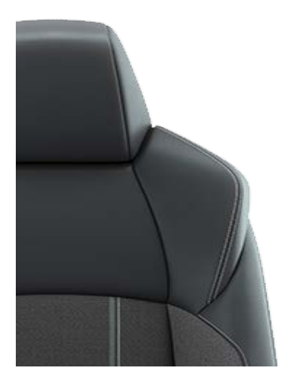
Black fabric and synthetic leather upholstery with grey stitching (Sol) (EA40)