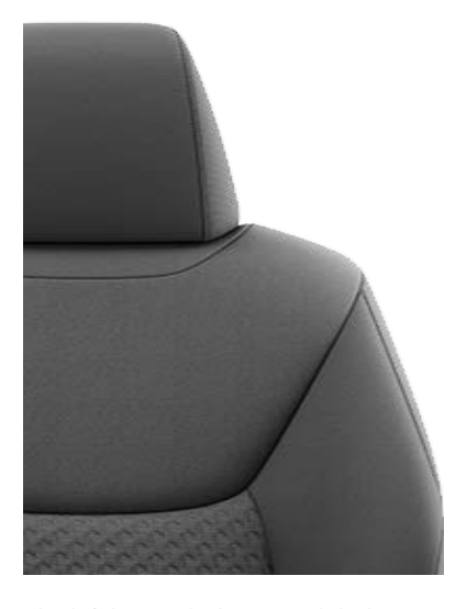
Black fabric upholstery with light grey roof lining (Luna) (FB20)