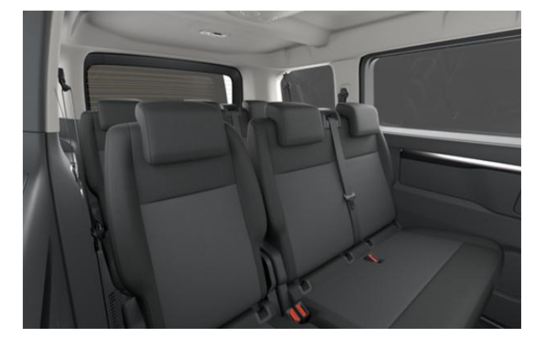
Dark grey fabric (43FT)