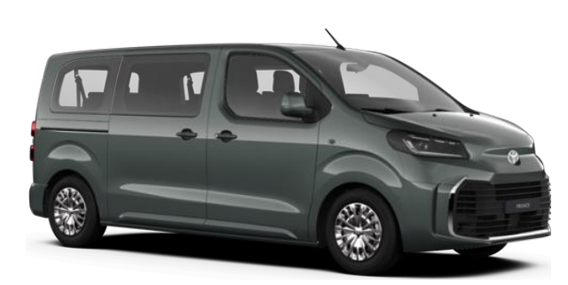
Green Velvet (EDU)