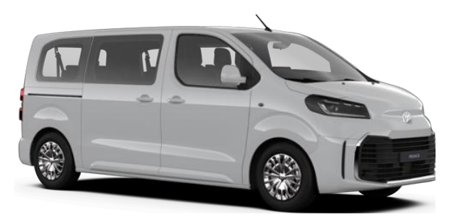
Icy White (EPR)