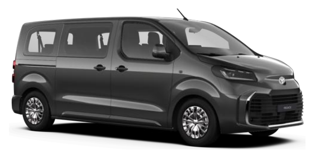
Titanium Grey (KKJ)