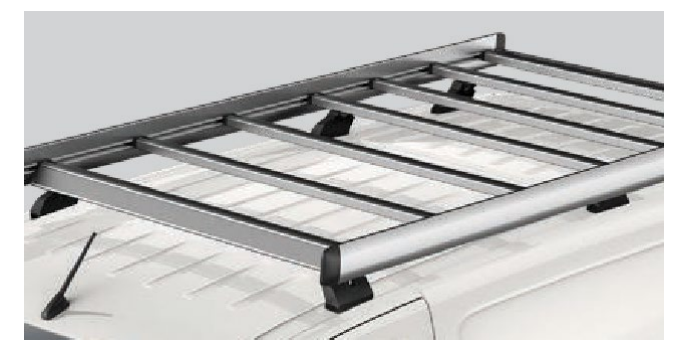
ALUMINIUM ROOF PLATFORM COMPACT (MWB) Heavy duty aluminium platform with integrated roller bar to facilitate loading.