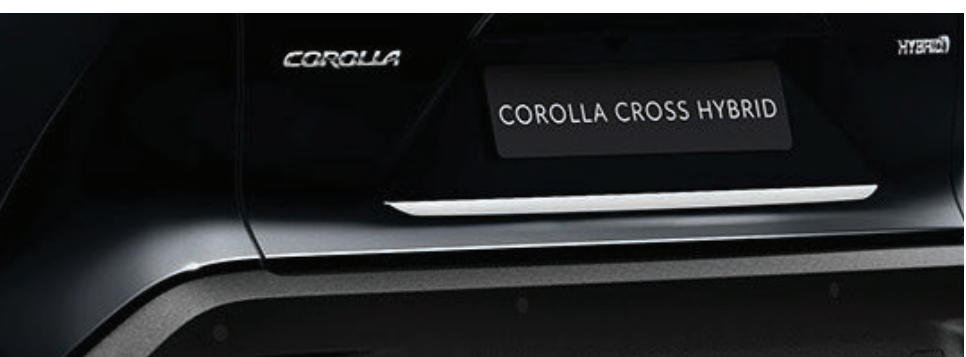
REAR CHROME GARNISH A smart finish to add an extra element of style to your car's boot.