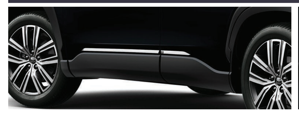
SIDE CHROME GARNISH Contoured to integrate smoothly with the side of your car and create a powerful low profile appearance.