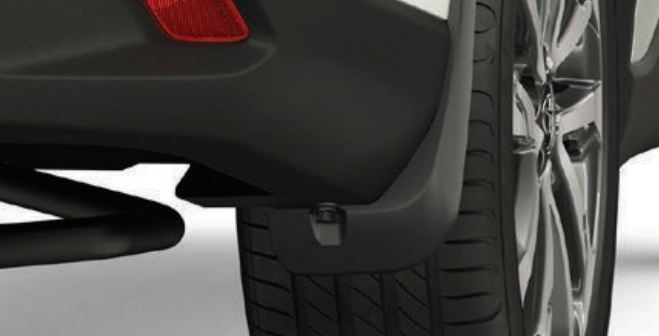
FRONT & REAR MUD GUARDS Designed to minimise water, mud and stones spraying onto your car's body.