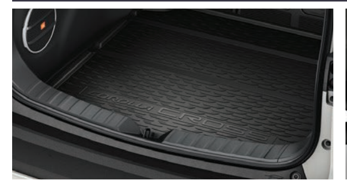
BOOT LINER Tailored to fit the boot of your vehicle and provide protection against dirt and