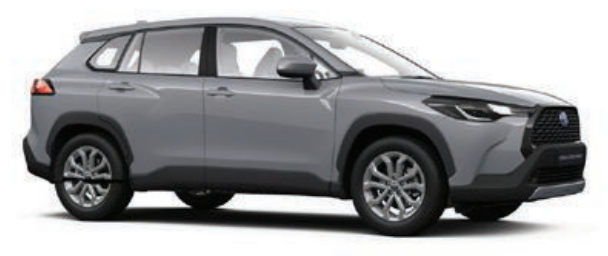
Manhattan Grey** (1H5)