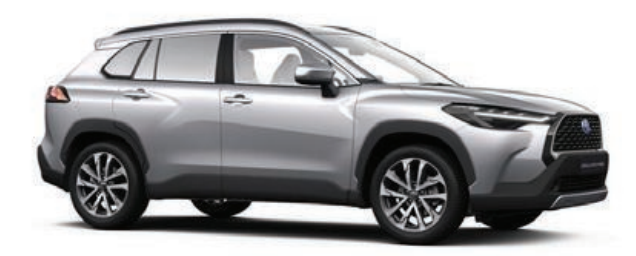
Atomic Silver** (1L0)