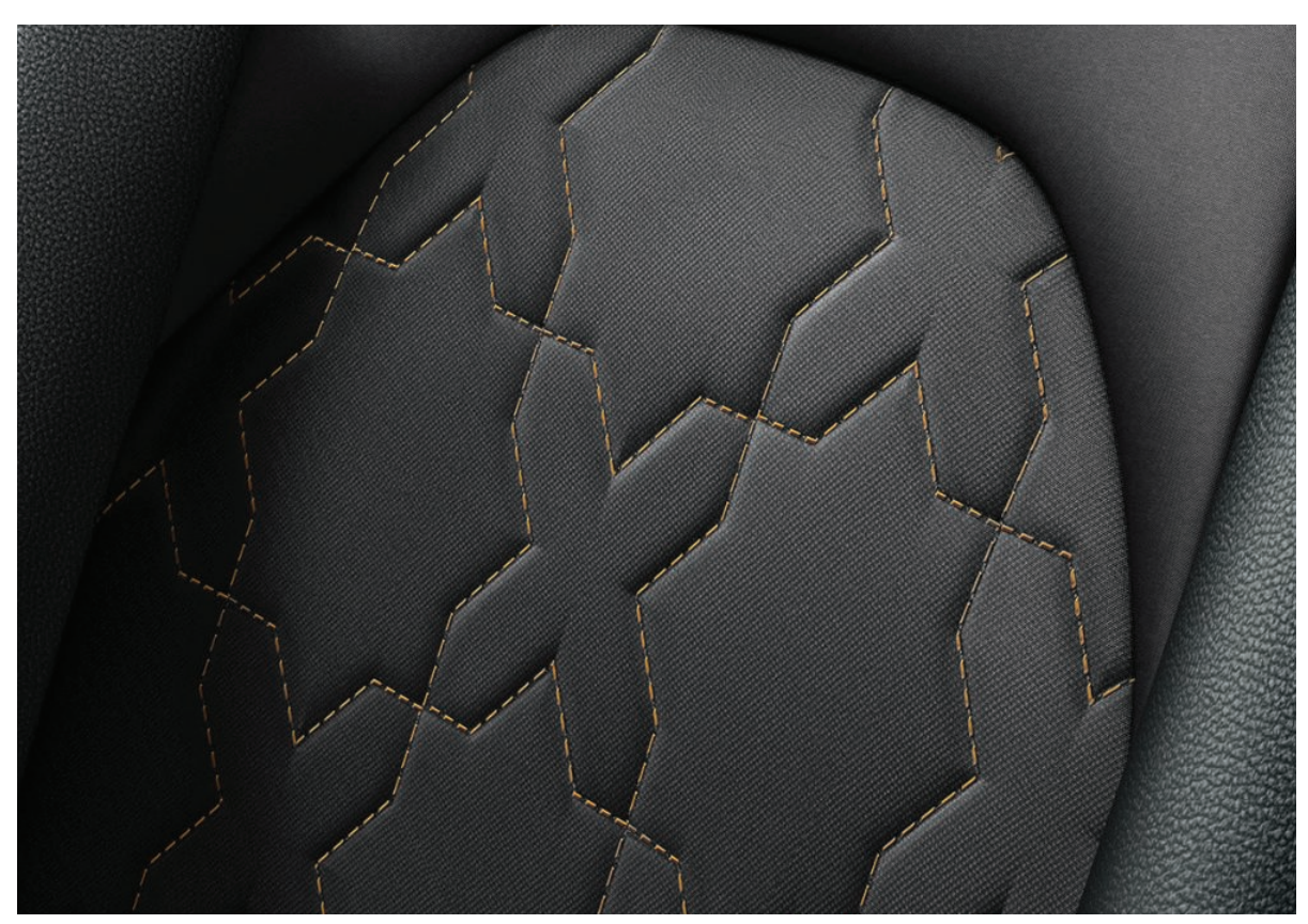
**Black fabric with leather-like bolsters with dark headliner - AYGO ENVY ONLY