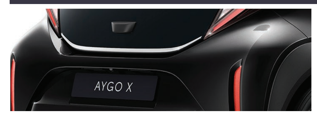
REAR GARNISH A smart chrome garnish to add an extra element of style to your car's boot.