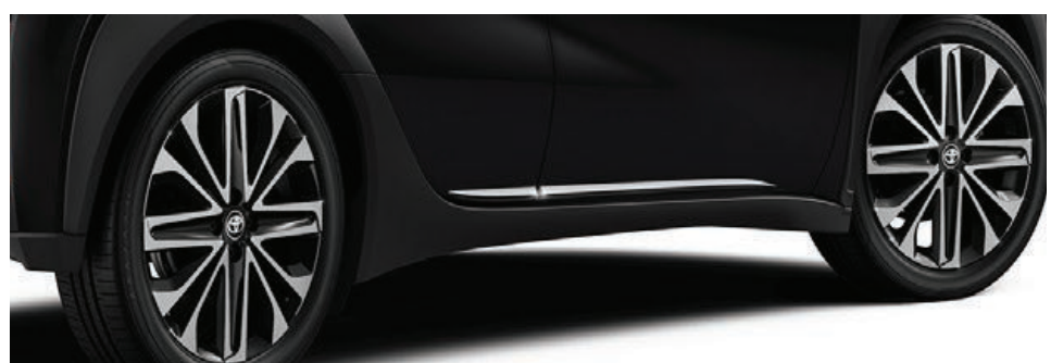
SIDE GARNISH Contoured to integrate smoothly with the side of your car and create a powerful low profile appearance.