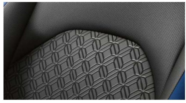
*Black fabric with dark headliner - AYGO X DESIGN ONLY