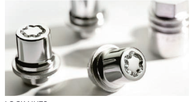
LOCK NUTS Replacing one nut on each wheel with a Toyota hardened steel wheel lock will maximise security for your valuable alloys.