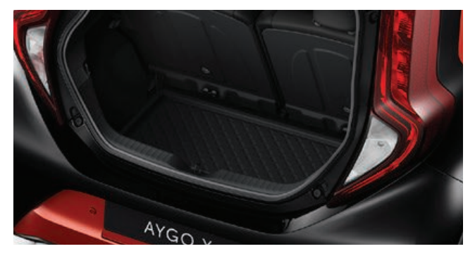
BOOT LINER Tailored to fit the boot of your vehicle and provide protection against dirt and spills.