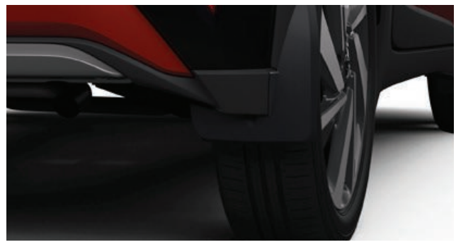
FRONT & REAR MUD GUARDS Designed to minimise water, mud and stones spraying onto your car's body.