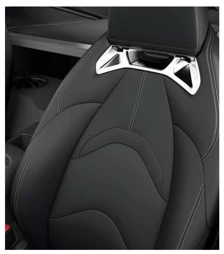
Black leather (LB20)

Black leather with a unified black instrument panel that delivers a fresh image.