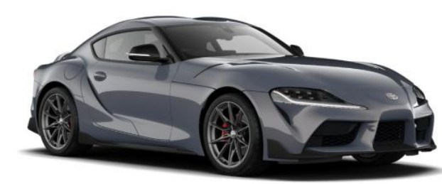
Sparkling Copper Grey(D03)