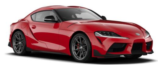
Prominence Red (D05)