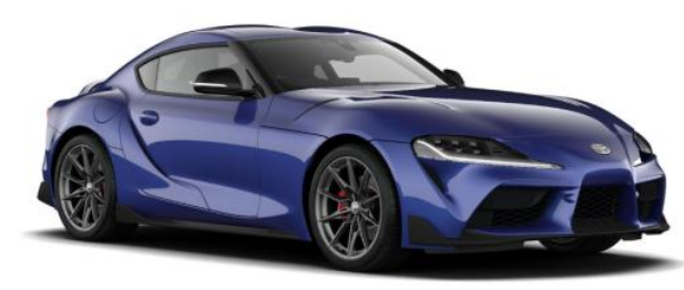
Portimao Blue (D13)