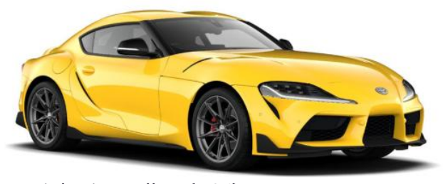
Lightning Yellow (D06)