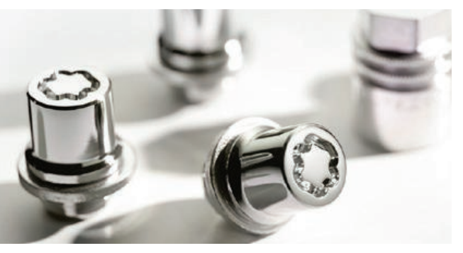
LOCK NUTS Replacing one nut on each wheel with a Toyota hardened steel wheel lock will maximise security for your valuable alloys.