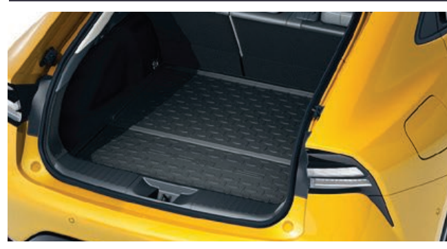
BOOT LINER Tailored to fit the boot of your vehicle and provide protection against dirt and spills.