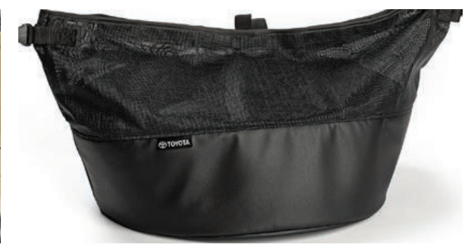
CHARGE CABLE BAG The stylish storage bag keeps your cable in good condition.