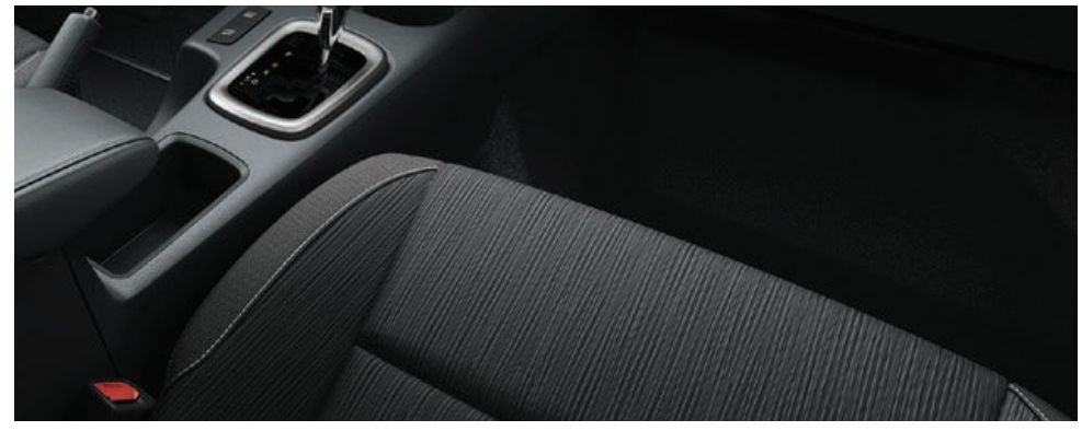
Black fabric with vertical pattern (FE20) SR5 Grade