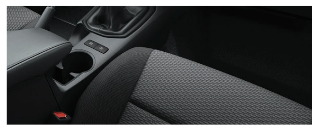
Black fabric with oval pattern (FC20) DLX Grade

A choice of two fabric and leather finishes are now available with a unified black instrument panel that delivers a fresh image.