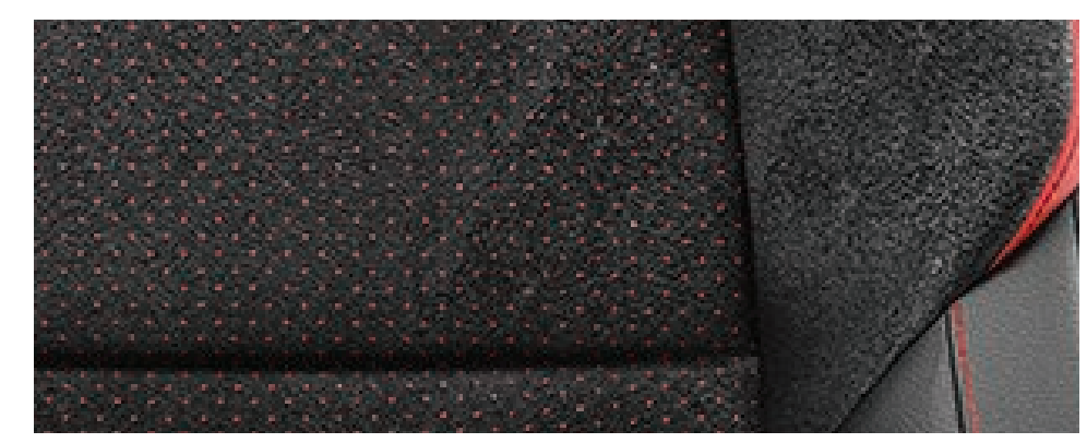
Black leather and synthetic suede (LG23) GR SPORT