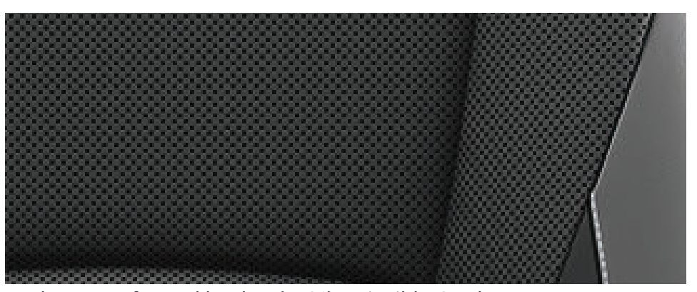
Dual tone perforated leather (LE21) Invincible Grade