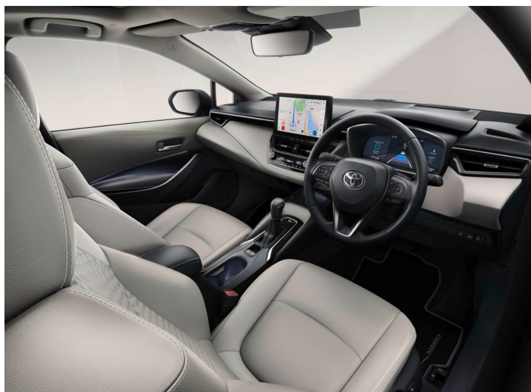
Black Fabric with Grey Stitching (Luna & Luna Sport) Light Grey Partial Synthetic Leather Upholstery (Sol)