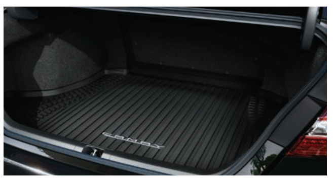
BOOT LINER Tailored to fit the boot of your vehicle and provide protection against dirt and spills.