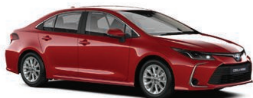
Pearl Red (3U5) Pearlescent