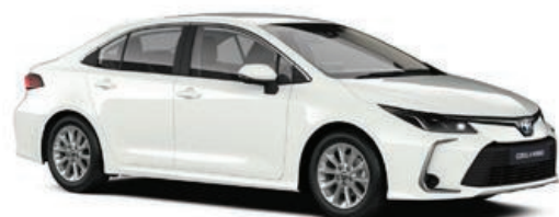
Pearl Ice White (089) Pearlescent